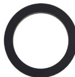
KAMLOK TESNENIE Hypalon, EPDM, Neopren