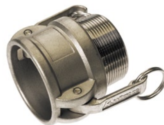
KAMLOK TYP B

Available in: Aluminium, Bronze, PP, Stainless steel