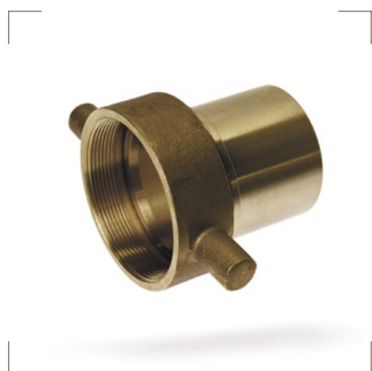
TANKWAGEN typ GI Materiál: Nerez, Mosazd Available in: Stainless steel, Brass