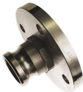
ADAPTER PRIRUBA / KAMLOK