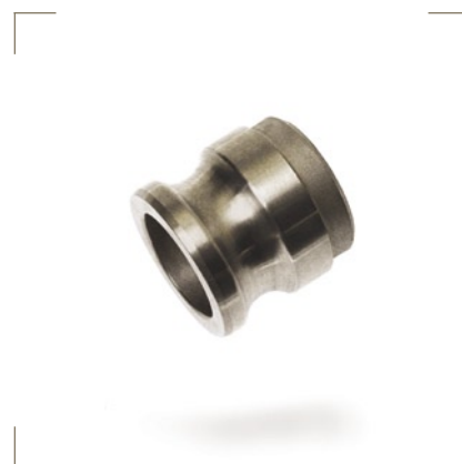
KAMLOK TYP BW-F pre zvaranie Available in: Stainless steel