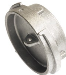
TW DIN 28450 typ VB Materiál: Nerez, Mosadz, Hliník Available in: Stainless steel, Brass Aluminium