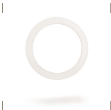
KAMLOK TESNENIE PTFE RAKLOK SEAL TEFLON