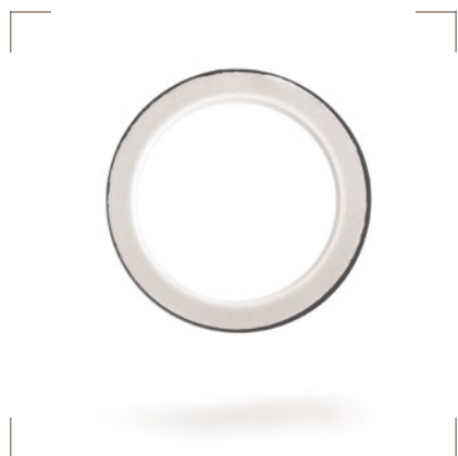
KAMLOK TESNENIE PTFE+Viton, PTFE + NBR Available in: Teflon + Viton, Teflon + NBR