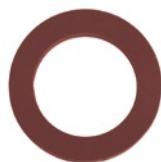
KAMLOK TESNENIE SILIKON