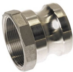
KAMLOK TYP A

Available in: Aluminium, Bronze, PP, Stainless steel