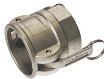
KAMLOK TYP D

Available in: Aluminium, Bronze, PP, Stainless steel