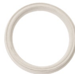
STORZ - tesnenie