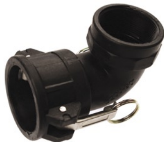
KAMLOK TYP D - 90°