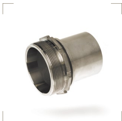
TANKWAGEN typ GA Materiál: Nerez, Mosazd Available in: Stainless steel, Brass