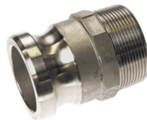
KAMLOK TYP F

Available in: Aluminium, Bronze, PP, Stainless steel