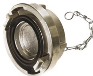
STORZ - záslepka