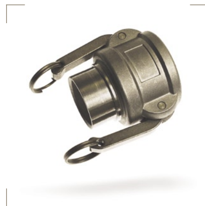
KAMLOK TYP BW-B pre zvaranie Available in: Stainless steel