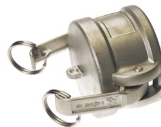
KAMLOK TYP DC

Available in: Aluminium, Bronze, PP, Stainless steel