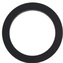
KAMLOK TESNENIE NBR, VITON