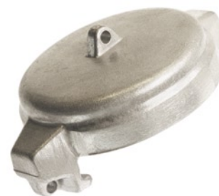
TW DIN 28450 typ MB Materiál: Nerez, Mosadz, Hliník Available in: Stainless steel, Brass Aluminium